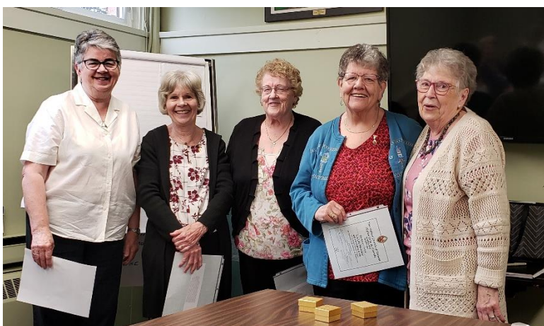
Life Membership Presentation